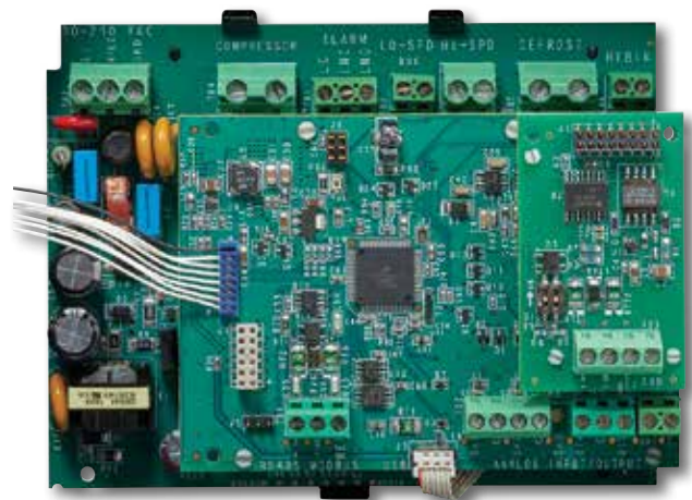
Temperature Defrost Smart Board