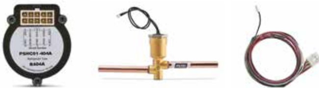
Quick Response Expansion Valve (QREV) and Precision SuperHeat Controller (PSHC)

The A525 refrigeration controllers communicate with the Quick Response Expansion Valve (QREV) and Precision Superheat Controller (PSHC) to simplify the monitoring and adjusting of superheat levels within the control menu. You can select any of 17 different refrigerants. The system sends alarms if superheat falls out of selected parameters and creates reports.