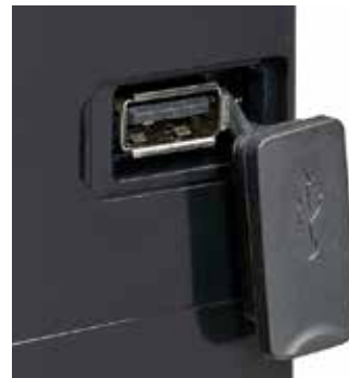
Easy Access USB Port

Whether it's a Verasys™ controls system or a building automation system, the A525 refrigeration controllers seamlessly connect to it. Simply plug and play. They'll recognize the device with minimal commissioning. You then have the advantage of flexible remote monitoring and report generation to track complete system performance.