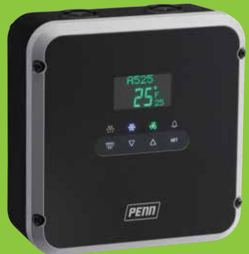
The A525 Series of Electronic Refrigeration Controllers with Adaptive Defrost

Remote connectivity provides improved control flexibility